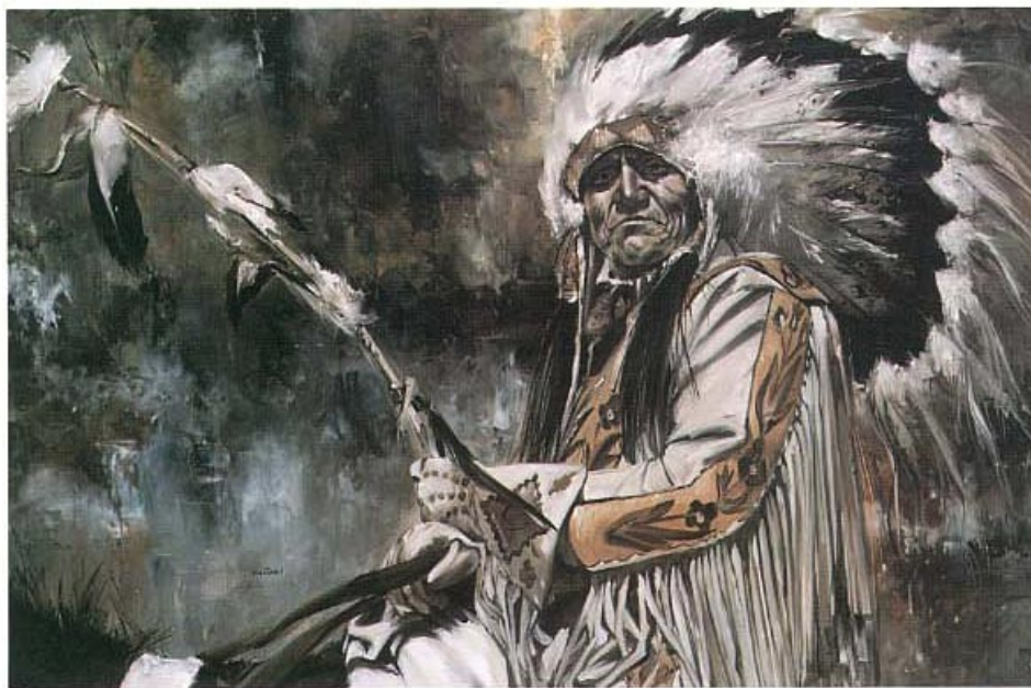
"Feather Stick," oil, 40" x 60"

in Albuquerque "to experience the people and their dance, music, color, and energy."