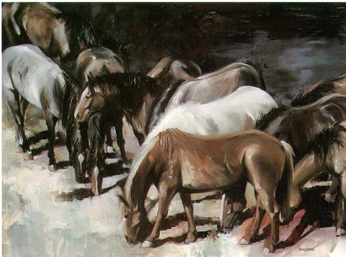
"Ten Together," oil, 30" × 40"