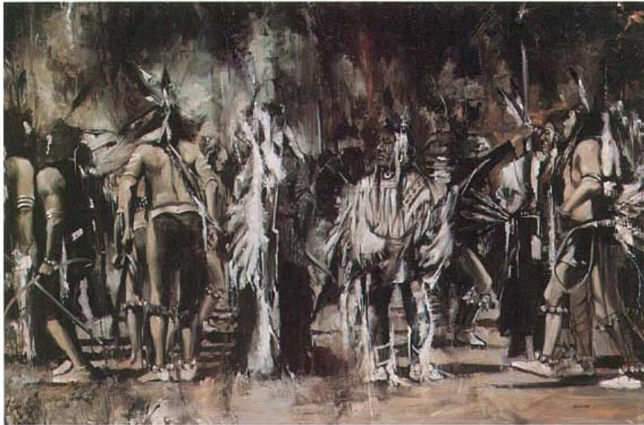
"War Dance," oil, 48" × 72"

tion—from strength and courage and defiance to wistfulness and familial pride, as when a warrior holds his small child. "I often choose images," says the artist, "of people I would like to have known." He adds that he has always been drawn to Native peoples' approach to life—their non-materialism and their respect for all of nature. Paintings such as "Prayer" and "Trade" re-create historical scenes of everyday life in Native America.