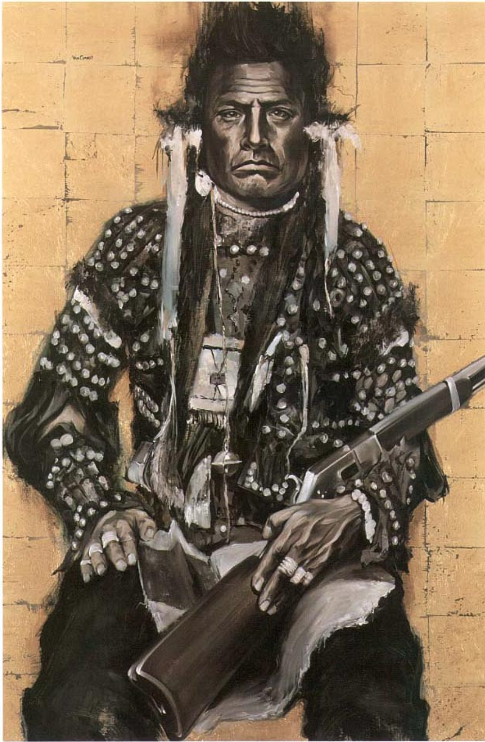
"Bear Shield," oil and gold leaf, 60" x 40"