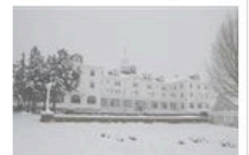
Buildings that give us