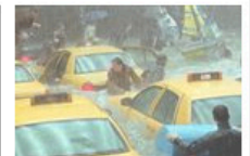
Gallery: 21 fake