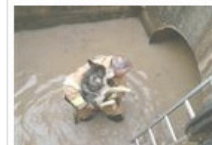
Animals rescued from