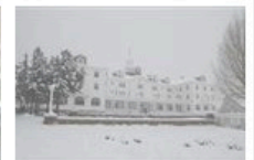
Buildings that give us