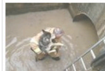
Animals rescued from