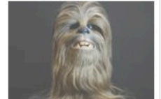
Star Wars characters,