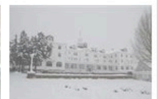
Buildings that give us