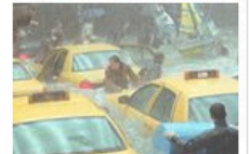
Gallery: 21 fake