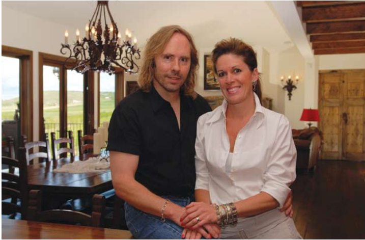
By L. Sara Bysterveld

Home is where the art is in creative couple's west-side casa