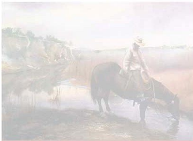
Bellend by William Matthews, watercolor, 19 1/2 x 29 1/2 inches

Spauerman Gallery, New York, New York, (212) 812-0206 www.spauerman.com