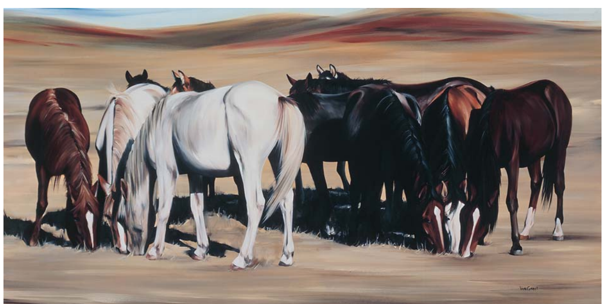
"Lunch Time," oil 36" x 72"

"I think the way an artist paints is a reflection of their personality and who they are," Paul says. Whether it's the nobleness of a venerable American Indian chief, the quiet pride of a lone cowboy moving his herd, the velvety softness of the herd itself — or even the expressive movement of a dancer — Paul's soul is indeed revealed. Sometimes it peeks from the canvas as if just a whisper; other times it commands to be noticed through bold simplicity and elegance. And for those who admire Paul's work, they may just find reflections of themselves hidden among the brush strokes.